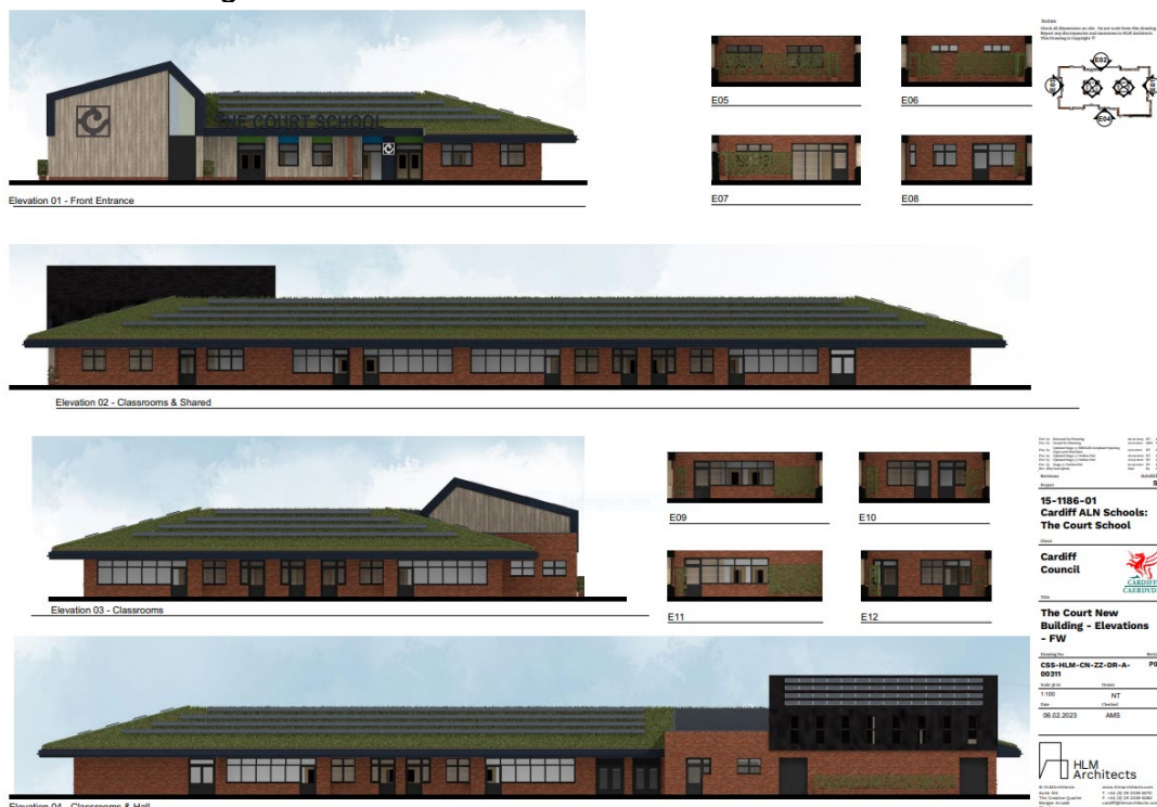
Figure 4: Proposed Elevations

9.10 The proposal would have a positive impact upon the character of the area, with the creation of additional sports pitches (for school and community use). The school buildings are of a functional nature and design and the new school is of a modern design and appearance and would not be out of place in the surrounding area and thereby raises no objections in this regard. Materials would be controlled through condition to ensure the school will enhance the surroundings.